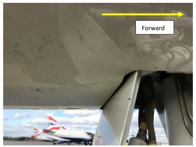
Skin panel deformation aft of NLG bay – viewed from rear right side