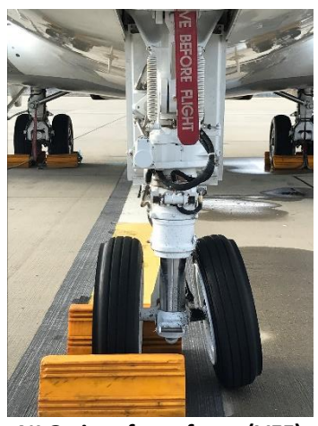
NLG view from front (VFF)