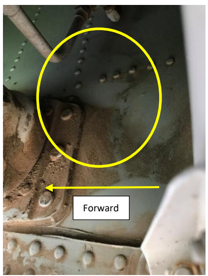
Zoomed in – deformation /buckling circled.