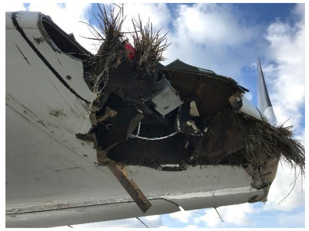
Underside outboard area of wing