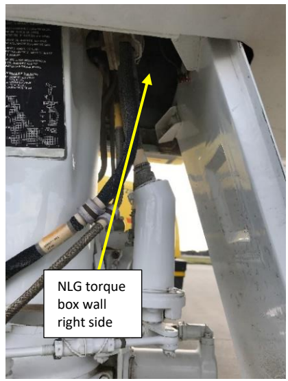
NLG torque box right side wall – zoomed out image