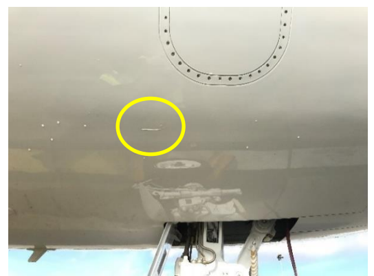
Butt joint ridge circled – right side of fuselage