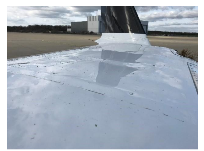
Left wing – upper surface – outboard view