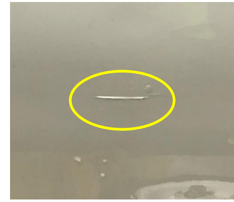
Close up image of ridge and protruding fastener head