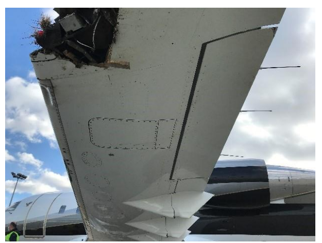
Underside of wing looking inboard