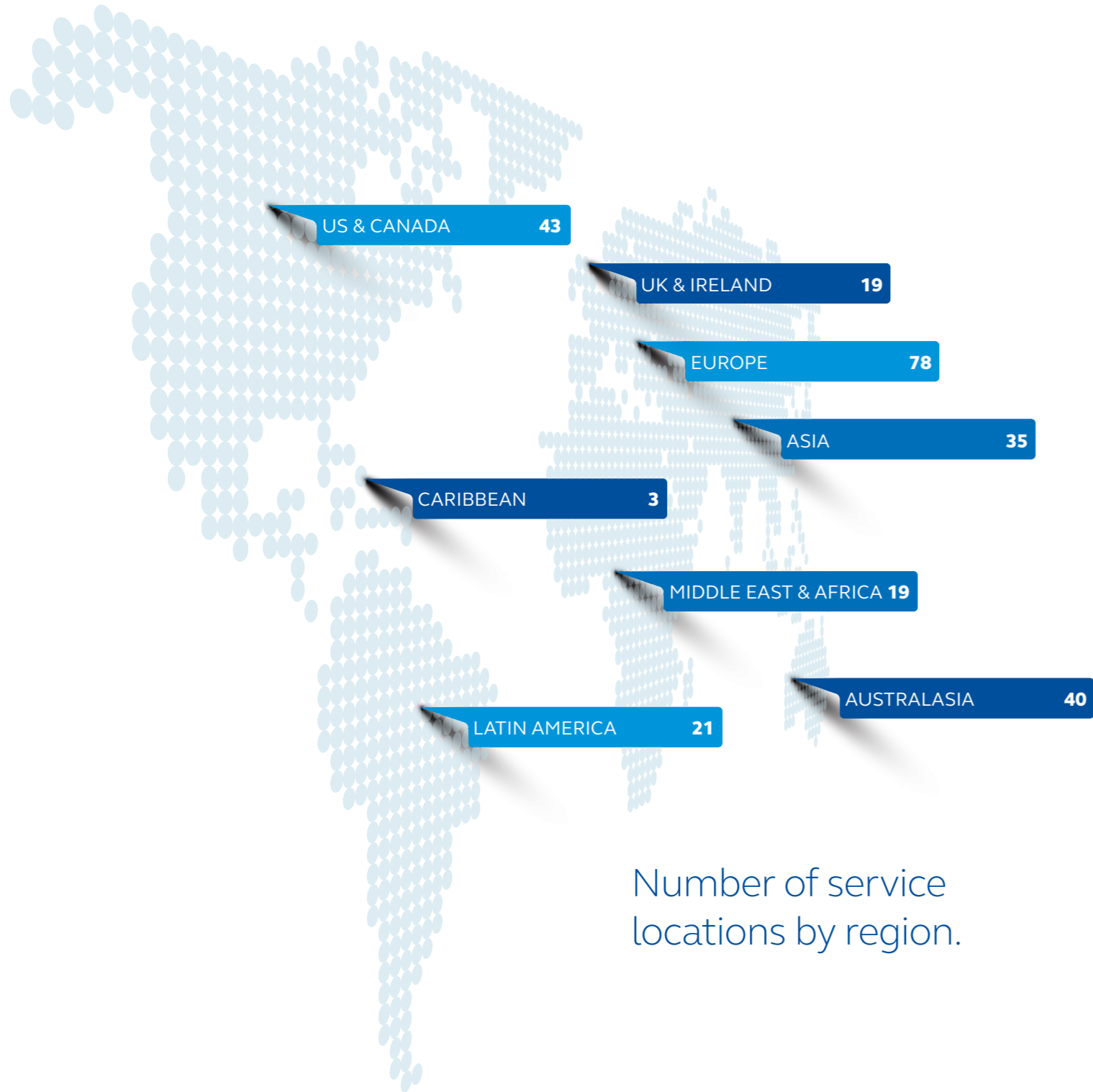
Number of service locations by region.

Our strategic locations enable our team to provide rapid response around the globe, with local knowledge.