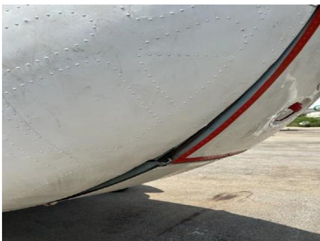
View of cargo door unable to close due to bent fuselage