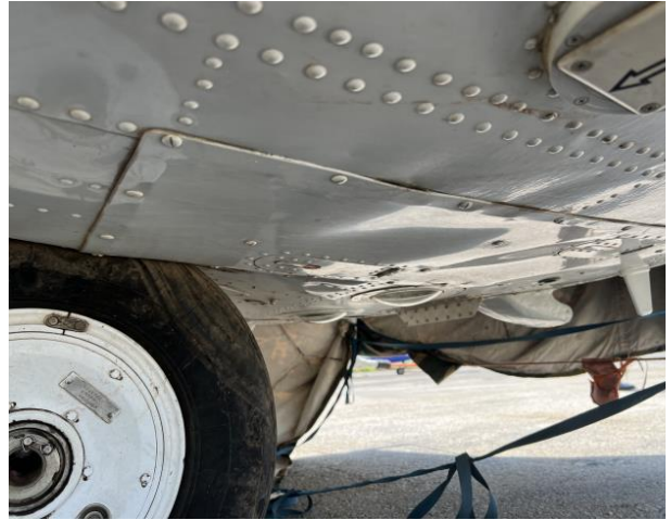
View of the nose gear pushed into the fuselage