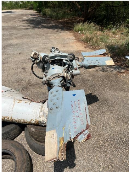
View of the three-blade tail rotor showing all three destroyed tail rotor blades