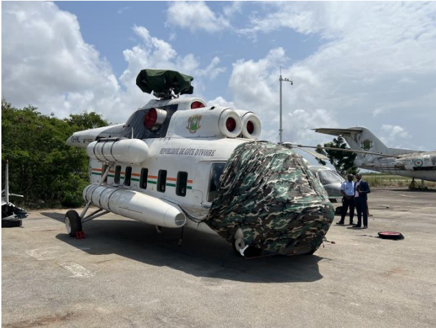
Forward right view of the helicopter