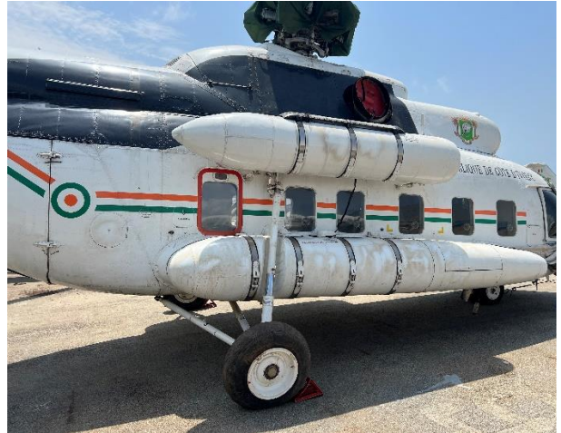
General right view of the helicopter