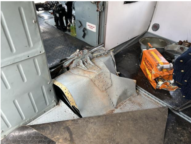
View of the flight deck floor where nose gear pushed up