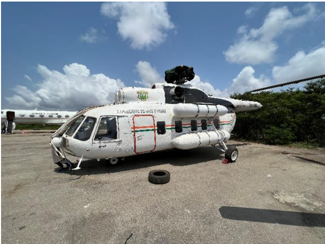
General left view of the helicopter