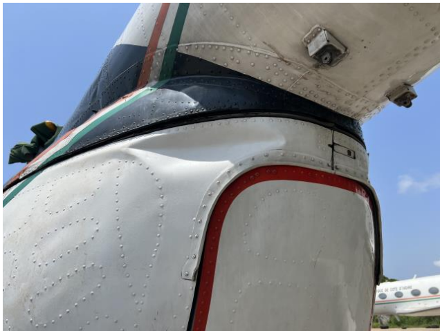
Left rear view of the helicopter with skin damage