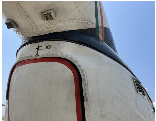
Right rear view of the helicopter with skin damage