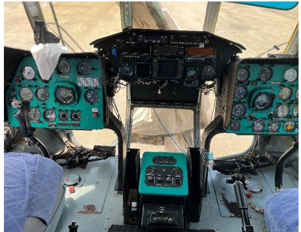
General view of the flight deck