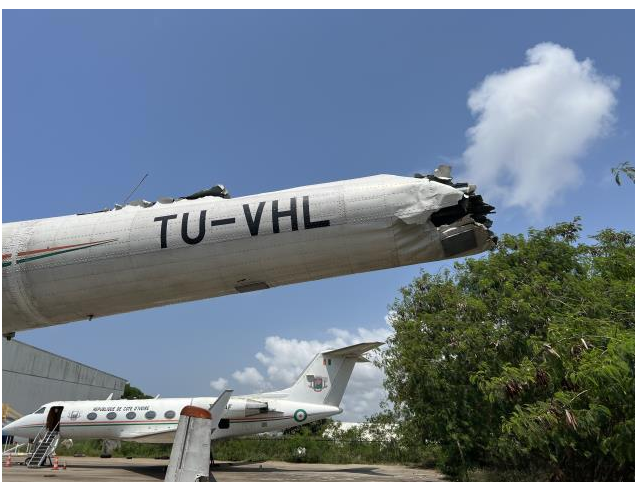
View of the severed tail boom