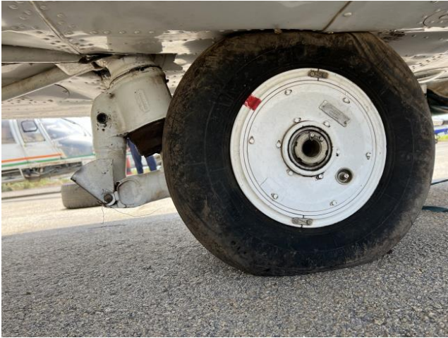
View of the nose gear pushed into the fuselage