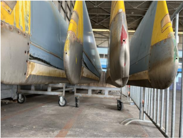
View of the main rotor blades with impact marks