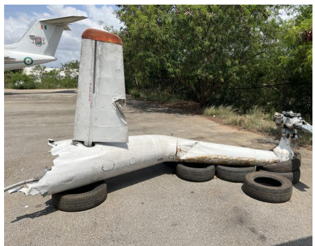
View of the severed tail boom