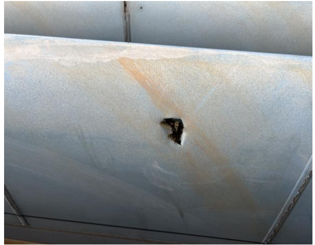
View of the main rotor blades with impact marks