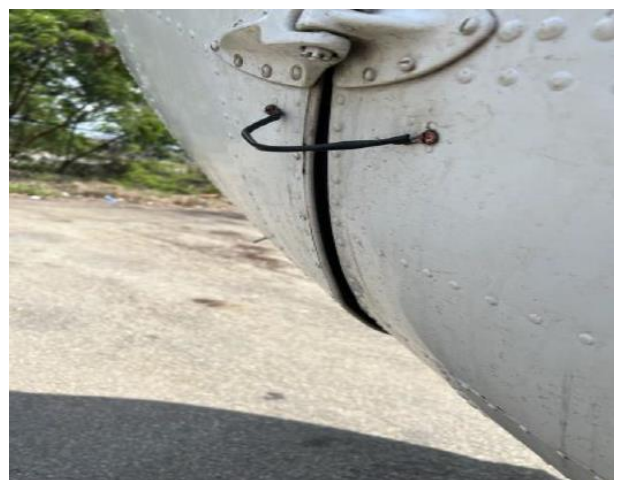
View of bent fuselage