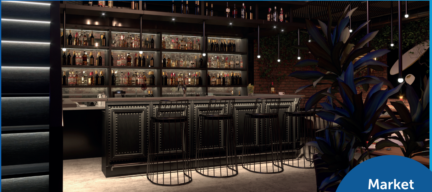
McLarens Hospitality' has launched!

Sharing news from McLarens UK & Ireland with colleagues and clients