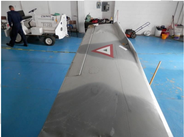
LH outbd wing