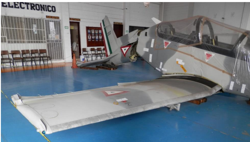
Aircraft looking at RH side