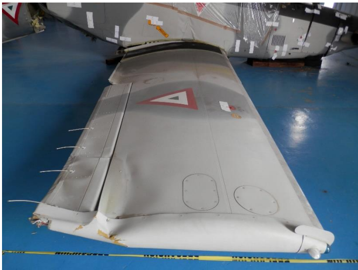
RH outbd wing