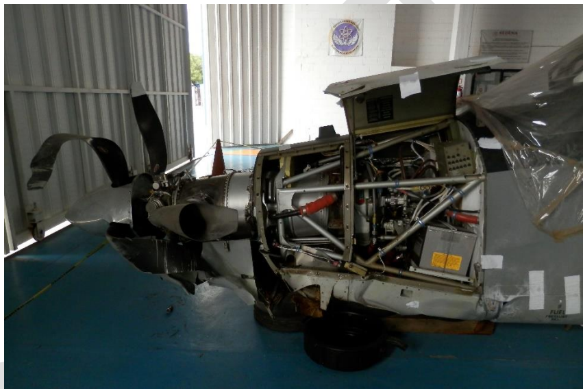
Aircraft powerplant – LH side