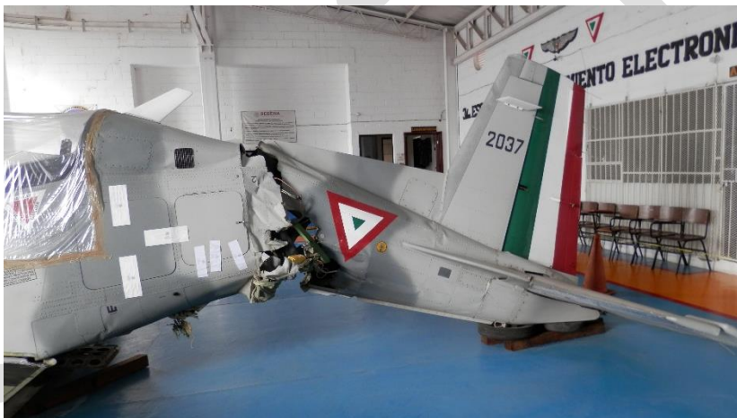
Aircraft Aft fuselage - LH side