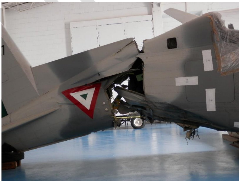
Aircraft Aft fuselage - RH side