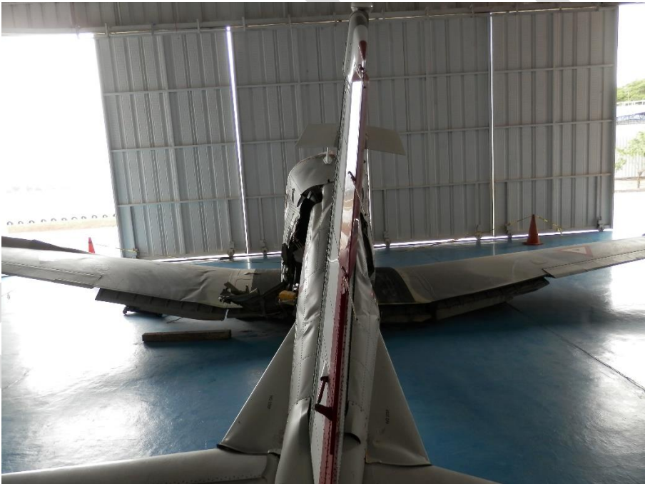
Aircraft looking forward from tail