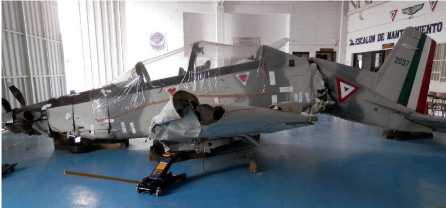
Aircraft looking at LH side