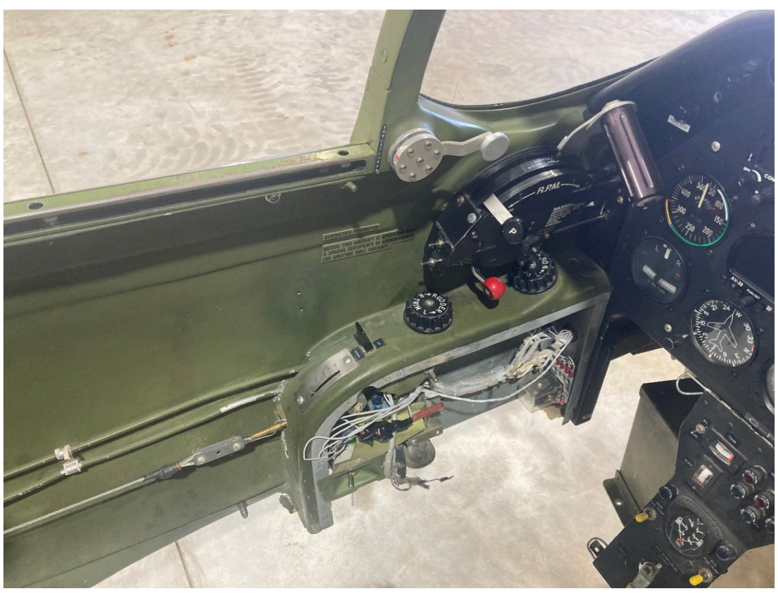
Page 5 of 13