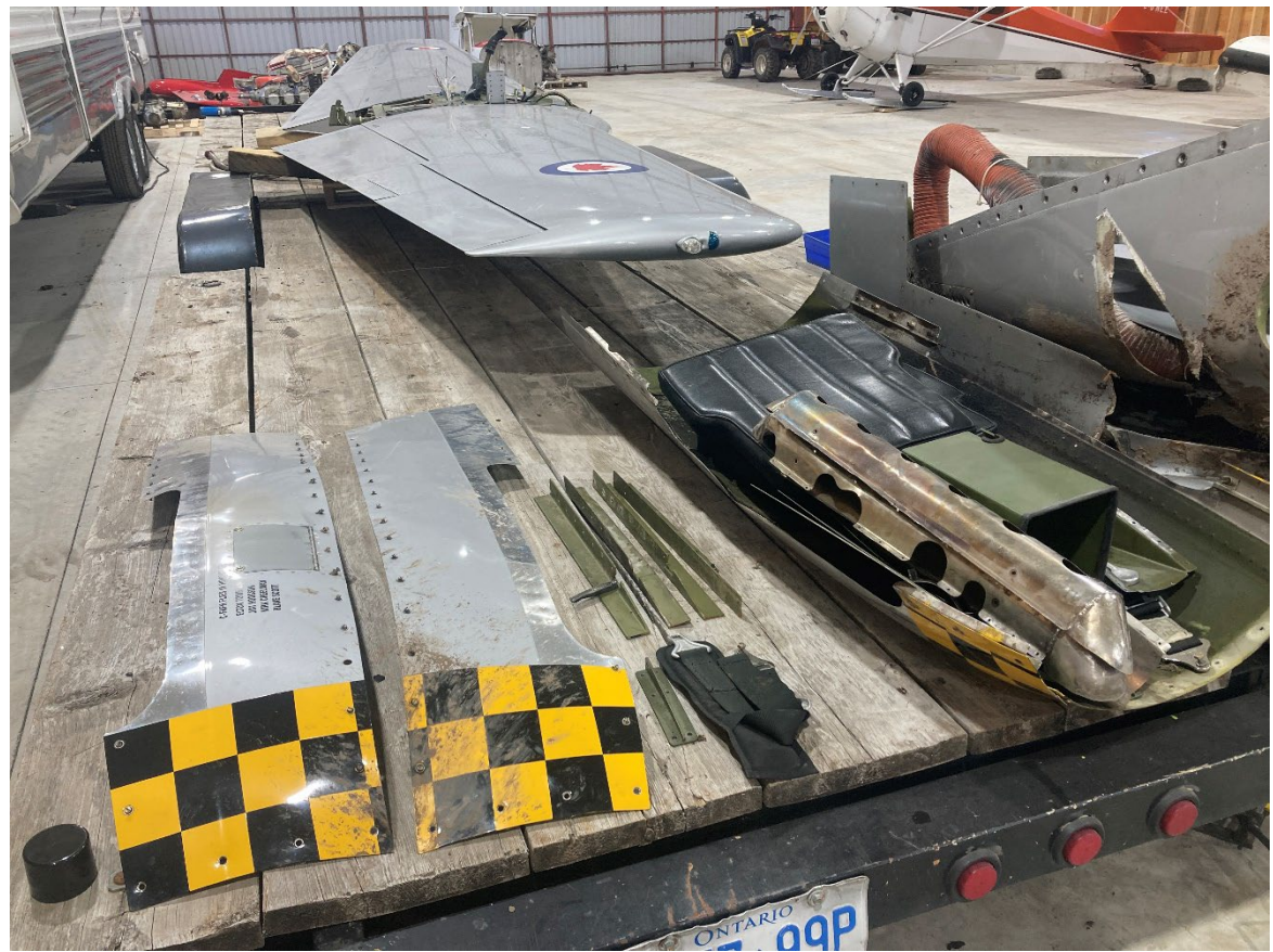
Page 10 of 13