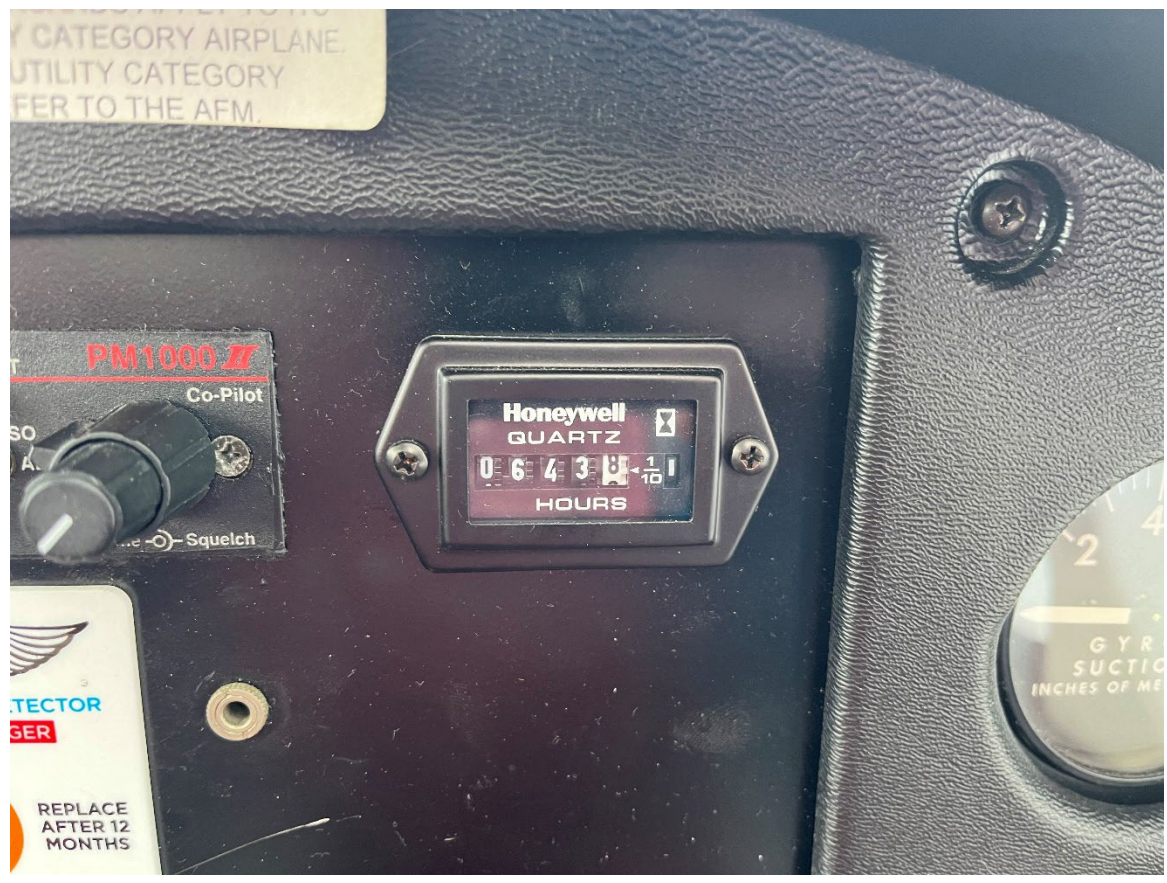
Page 8 of 10