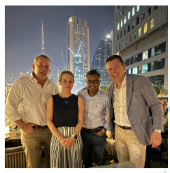
UAE Client event