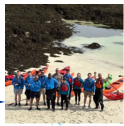
CII Future Leaders Nature Summit