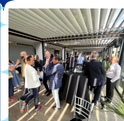
Real Estate Conference