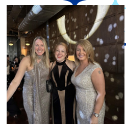
Ladies of Insurance Lunch