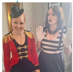
Style in the City