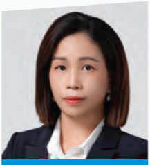
Hang Dong VIETNAM

+60 19 3 350 221 | Mobile hm.choong@mclarens.com