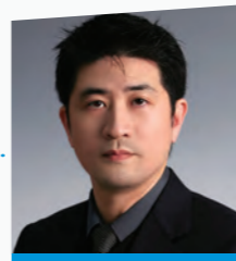
YS Tsai TAIWAN

+91 98 2043 9883 | Mobile amarnath.maurya@mclarens.com